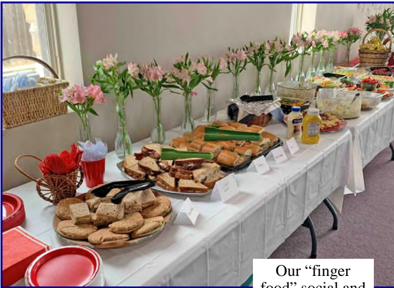
Our “finger food” social and great desserts.